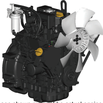
Image shown may not be actual engine